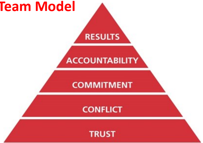
The Five Behaviors of a Cohesive Team™ Model